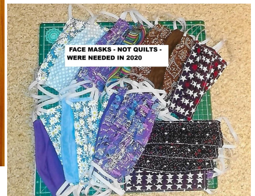
FACE MASKS - NOT QUILTS - WERE NEEDED IN 2020