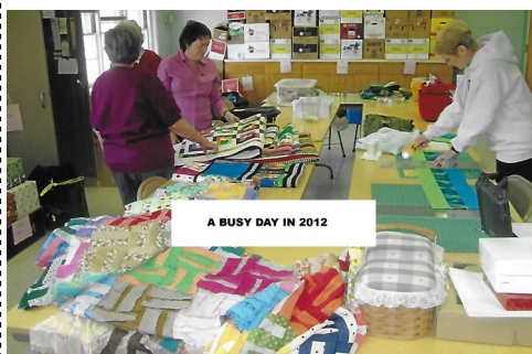
A BUSY DAY IN 2012