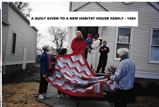
A QUILT GIVEN TO A NEW HABITAT HOUSE FAMILY - 1994