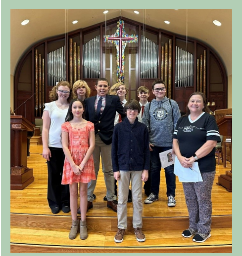
Thank You FOR GENEROUSLY

We saw a significant increase in 2024 pledges. We have a balanced budget for 2024. Thanks for your continued financial support and please remember to keep up with your monthly pledges. Your contributions are the life blood of this congregation and allow us to continue to show God's love to those around us.